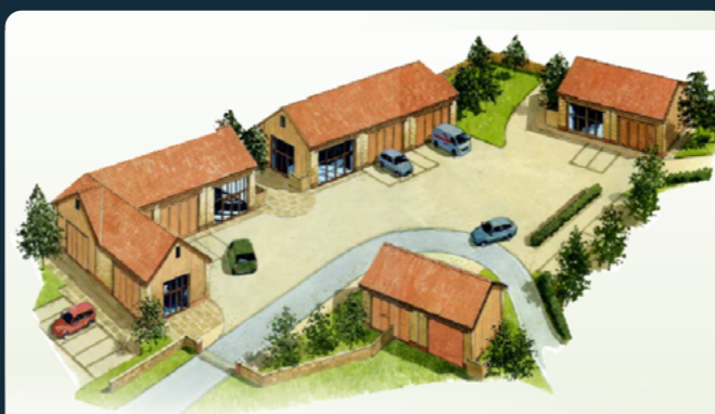
FarfieldWorkspaces Architect's original sketch

2025 sees the 20th anniversary of Farfield Workspaces in Wykeham, as well as the conclusion of three years of renovations including replacing its iconic cedar boarding. The site was originally designed to complement the offices of Wykeham Business Centre by offering workshops and light engineering units. However it has adjusted to suit all manner of businesses and