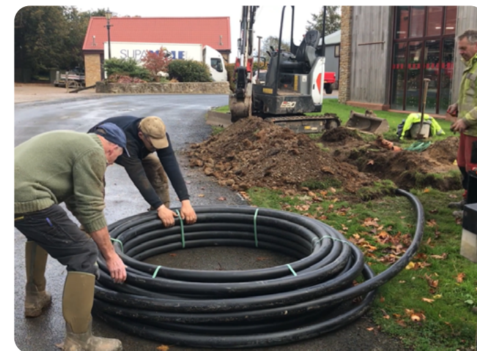
Internet - Wykeham, Business Centre